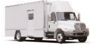
High Top Vans